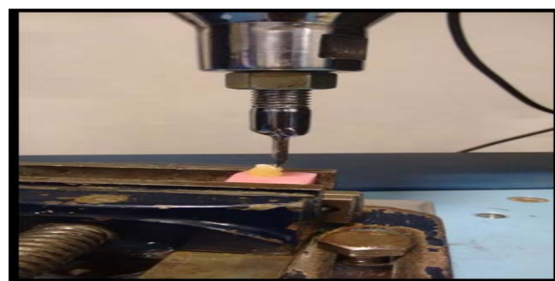
Fig. Universal Testing Machine