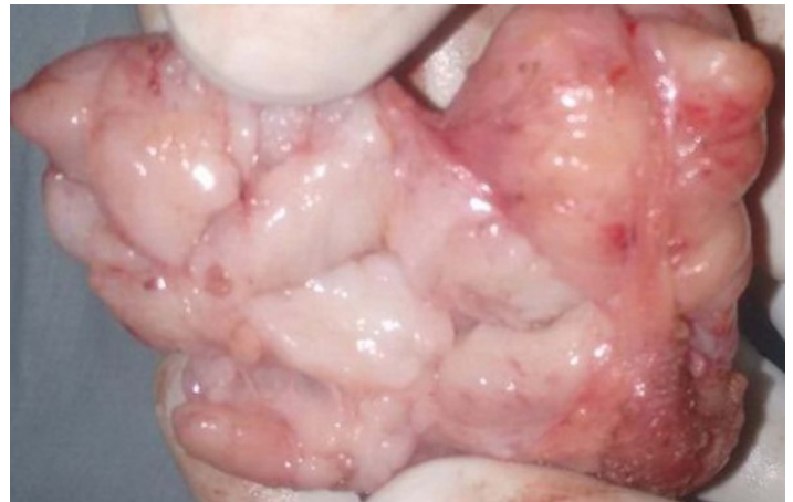
Figure.2 Excised Fibroadenoma