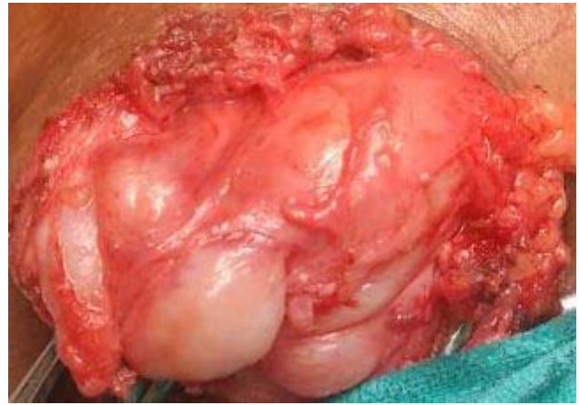
Figure.1 Surgical Exposure Of Fibroadenoma Of Accessory Breast In Axilla

Patient underwent excision biopsy. Per operative finding was a subcutaneously located lesion which was excised. This anatomically superficial location of the lesion explains why this is an example of ectopic breast tissue rather than an extension of breast parenchyma into the axilla (axillary tail of Spence) which is located deep. Histopathological examination of the resected specimen is also suggestive of circumscribed mass comprising of glandular and stromal hyperplasia glandular hyperplasia show both pericanicular and intracanicular pattern of glandular proliferation benign proliferative disease fibro adenoma (mixed type) axillary extension of breast.