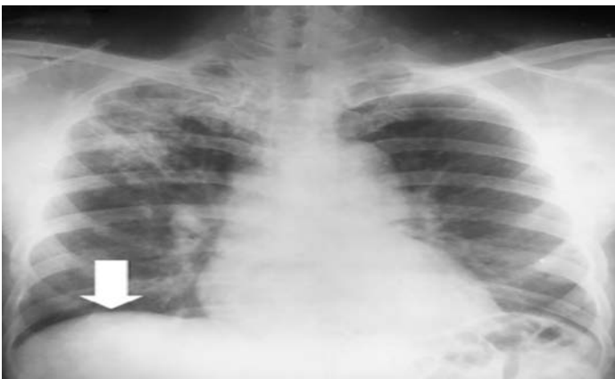
Figure 3: Chest radiograph taken after 24 hours showing resolution of pneumoperitoneum pointed by the white block arrow without the radiolucency under

Pneumoperitoneum as shown in Figure 3. Discharged diagnoses were COPD in AE , pneumonia, and ISP. Abdominal CT scan was no longer requested. On follow- up thirty days after discharge, patient was essentially normal.