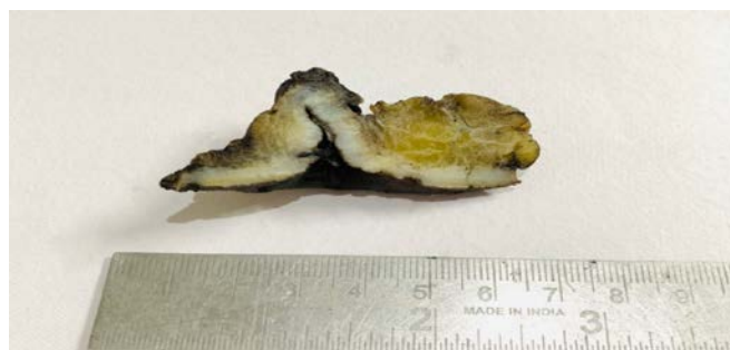
Figure 1: Umbilectomy specimen showing a sinus tract of length 1.5cm

Clinically a diagnosis of umbilical pilonidal sinus was made and MRI was taken which was reported as suggestive of umbilical pilonidal sinus or omphalitis. Patient was started on antibiotics and anti-inflammatory drugs. The patient underwent umbilectomy procedure.