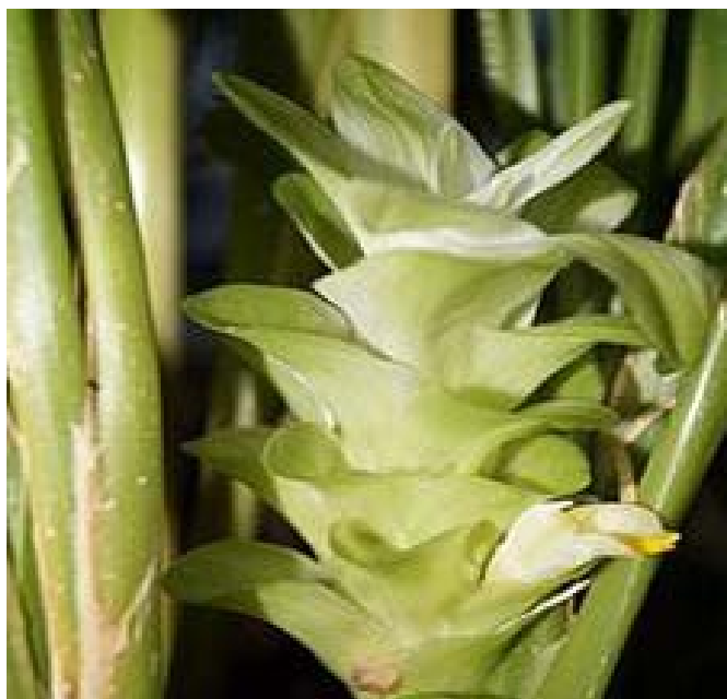
Fig. 1: curcuma longa

tautomeric composite obtainable in enolic form in organic solvents and as a keto form in water Fig. 2.